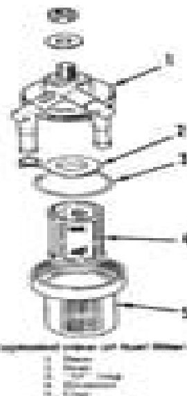
Fig. 826-3—Exploded view of fuel filter assembly

With reference to Fig. 826-3, disassemble the fuel pump assembly. Inspect all components for damage and excessive wear and repair if needed. Clean components as needed with a suitable cleaning solution. Blow dry with clean compressed air. If compressed air is not available, use only lint-free cloth to