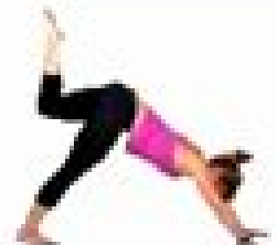
Knee circles (step 2)