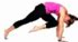
Knee to nose