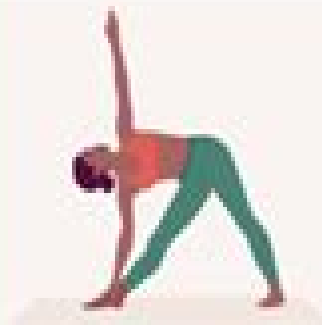
Extended Triangle Pose