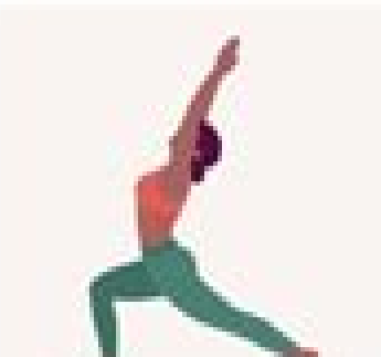
Warrior 1 Pose