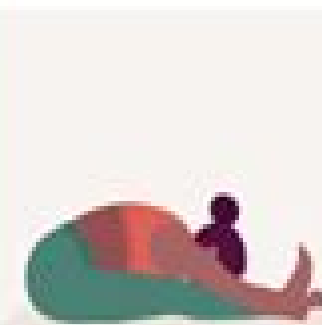
Seated Forward Fold