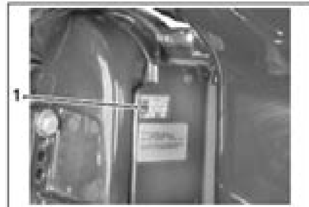
1. Model and serial number

Outboard model and serial numbers are located on the swivel bracket and on the powerhead.