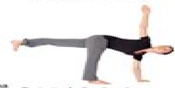
Parivrita Ardha Chandrasana

This pose stretches the back of the legs and improves the circulation in the abdominal organs. It calms the brain and stimulates the liver and kidneys.