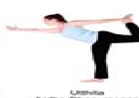
Uthita Ardha Chandrasana

This posture improves balance and coordination. This opens the hip joints, stretches the hamstring muscles and tones the legs.