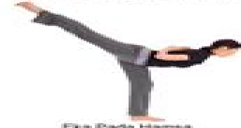
Eka Pada Hamsta Parivrtasana

This standing balance pose strengthens the ankles and thighs. It improves balance and cleanses the organs.