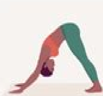
Downward Facing Dog