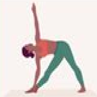
Extended Triangle Pose