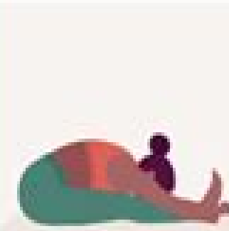
Seated Forward Fold