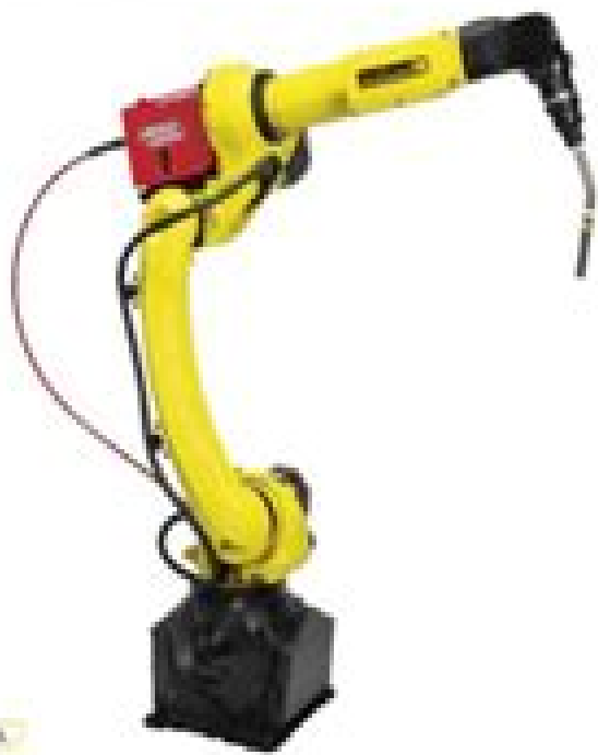
ARC Mate 100iD/10L